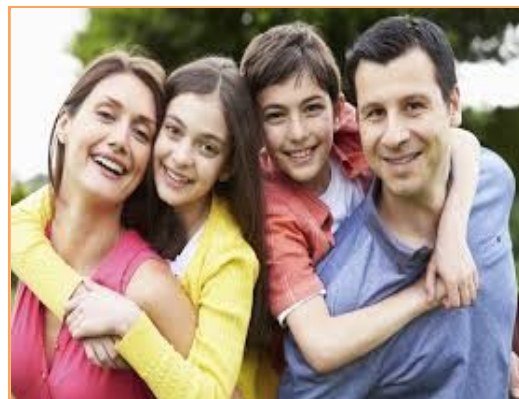
Talk with your kids early and often about the dangers of underage drinking and marijuana

Source: Office of the Surgeon General. (2007). The Surgeon General's Call to Action To Prevent and Reduce Underage Drinking: A Guide for Families (PDF 889KB) Rockville, MD: U.S. Department of Health and Human Services.