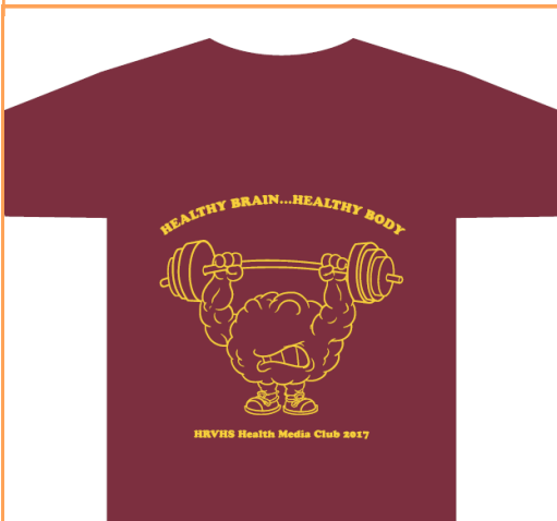
HRVHS H.E.A.L.T.H. Media Club 2017 sweatshirt

Talk to your child about joining a H.E.A.L.T.H. Media Club. It is a great way to get involved in the community and have fun at the same time!