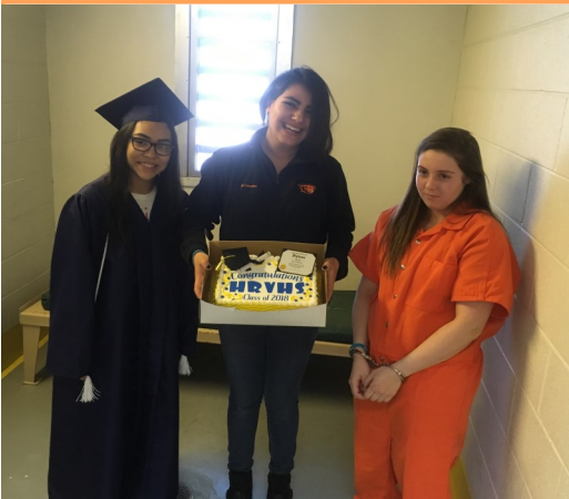
Graduation theater ad photo

The Hood River Valley High School HEALTH Media Club is currently working on creating stickers for the 4th of July Sticker Shock Campaign, and the Halloween Sticker Shock Campaign. They are also creating a Theater advertisement for Graduation, which involved a photo shoot at the Jail at the County Courthouse. They had a busy year, creating several theater ads, running a poster campaign, creating radio public service announcements, writing letters to the editor, and participating in the Super Bowl Sticker Shock. They plan to have a Sticker Shock Event on June 28th, for the 4th of July and help man the Prevention booth at the County Fair at the end of July.